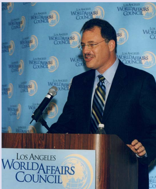
Larry Diamond Senior Fellow, Hoover Institution, Author, Squandered Victory

The problem began to hit me in stark relief three nights after I arrived in Baghdad early in January of 2004 when one of my colleagues on the governance staff stormed into the office after a meeting of the Iraqi Governing Council, slammed her purse down on her desk, and uttered, “We have a problem and no one wants to deal with it. The Iraqi Governing Council is starting to issue orders and the ministers are starting to obey them.” Several of us were standing around and we burst out laughing. On the face of it, this statement was absurd and in a way hilarious—initially,